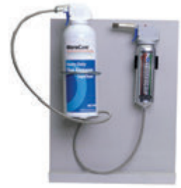
Includes a can holder, screws and TriggerGrip™ holder.