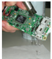
Rinsing the board perfects the cleaning.