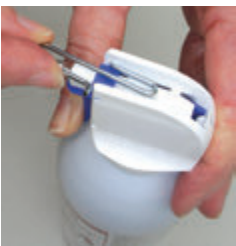
Easily attaches to most MicroCare® aerosols.