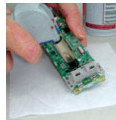
Scrubbing action enhances cleaning.