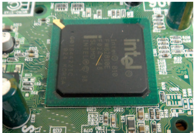
BGA components evolved away from space-wasting legs, and all electrical connections are under the chip, using micron-sized dots of solder to complete the circuits – BGA designs also increase exponentially the number of connections that can be made, since the number of possible connections is limited by the area of the chip, not the perimeter

It came as no surprise to the technical experts at MicroCare and