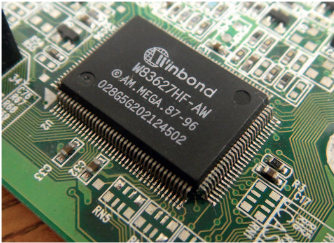
Surface mount technology stayed with the same basic design as through-hole chips, but miniaturised all the pieces – by miniaturising the legs and using all four sides of the chips, the number of electrical connections could be increased to 100 to 200 on the densest designs

But the component designers weren't finished. By the end of the 1990s, ball grid array (BGA) components were becoming commonplace. Initially seen as micro-processors in computers, BGA components jammed still more transistors into the smallest possible package. Each chip supported thousands of tiny solder connections (hidden underneath the chip) which make them extremely rugged, even in harsh environments. BGA designs have stand-offs measured in microns, but they make for smarter electronics. In fact, a single component can serve as the central brain to process data and also drive peripheral systems on the LWD tools, such as the data link to the surface and the interfaces with the sensors.